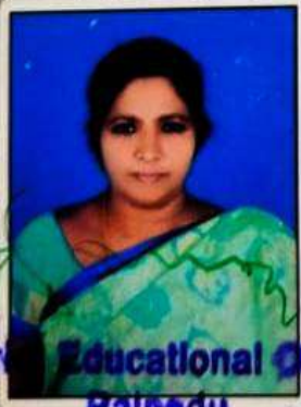
District Educational Officer Palnadu