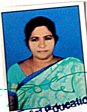
Mandal Educational Officer Piduguralla (Md), Palnadu Dt.